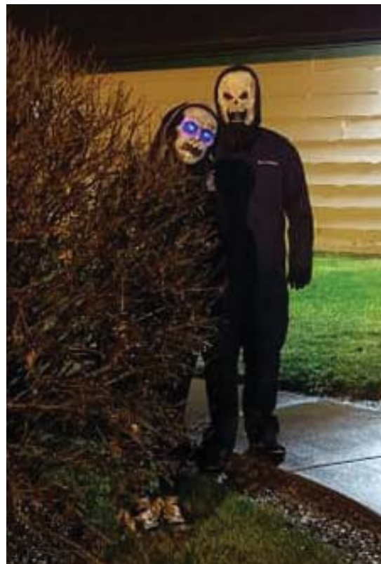
The guests arrive.