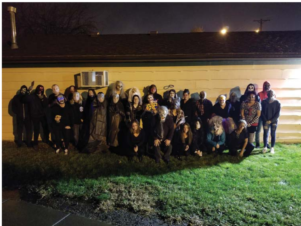
Turning Glory House into a haunted house involved the time and hard work of many people, but it was worth it to hear a client say, "I haven't laughed this hard in years."