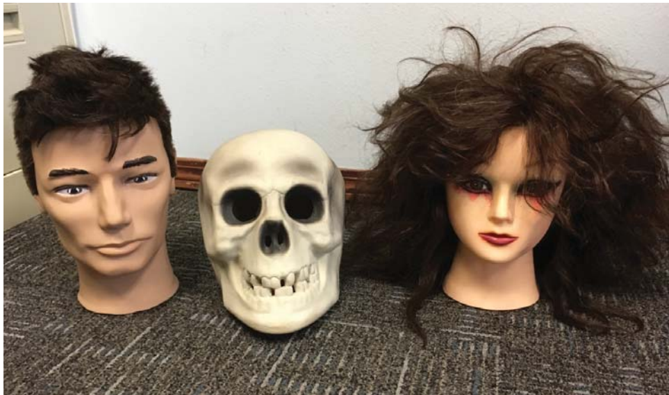
The party committee prepares for Halloween.